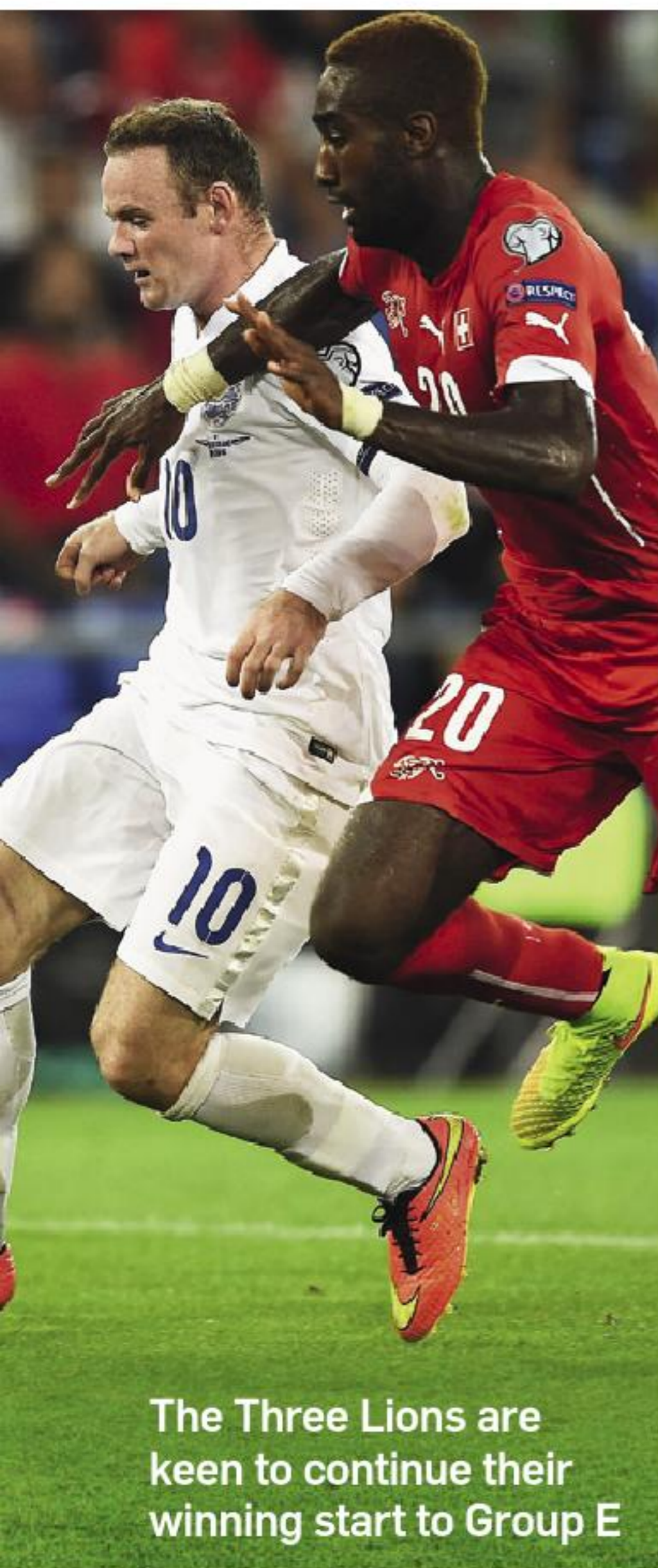
The Three Lions are keen to continue their winning start to Group E