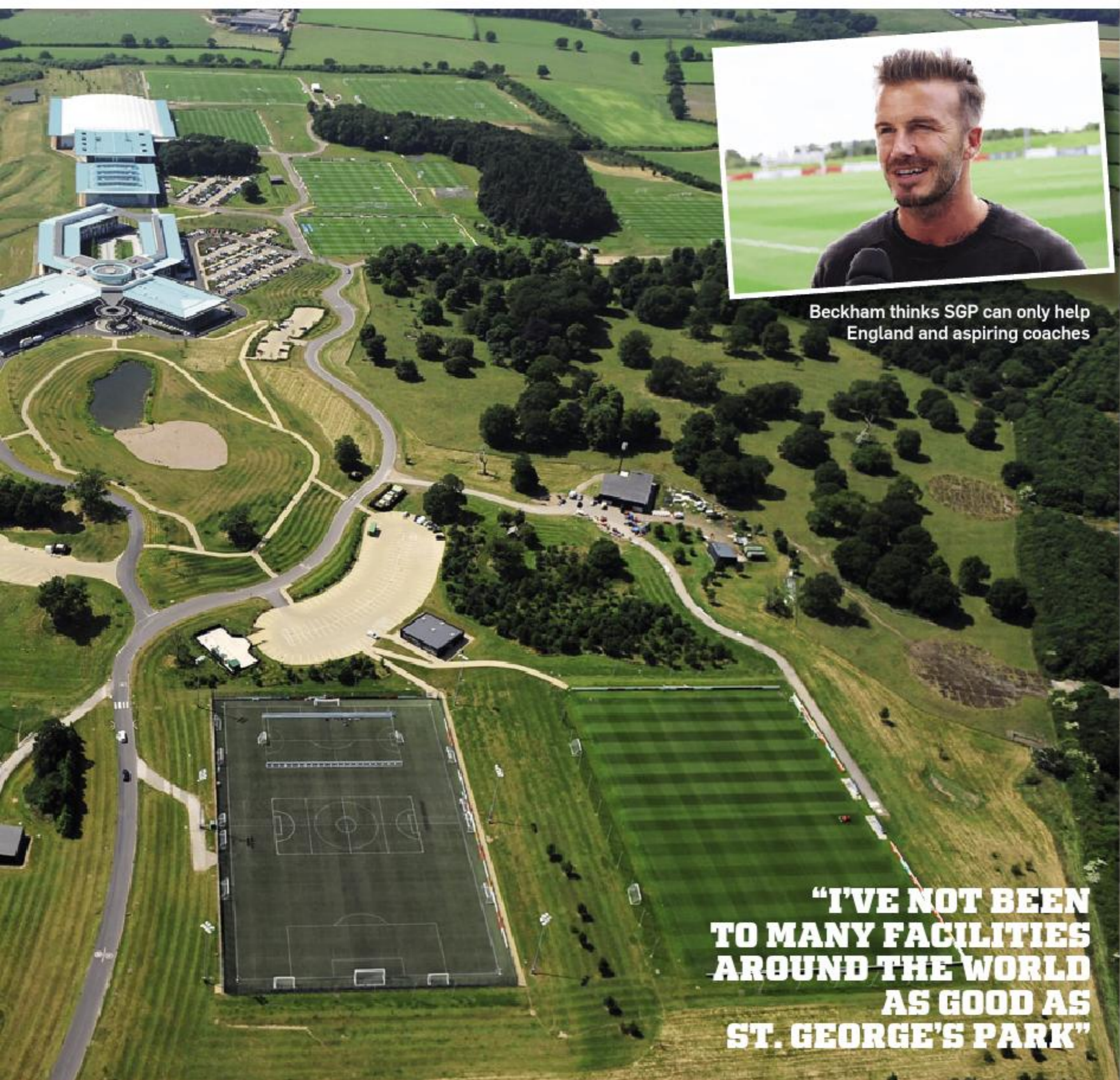
Beckham thinks SGP can only help England and aspiring coaches

"I'VE NOT BEEN TO MANY FACILITIES AROUND THE WORLD AS GOOD AS ST. GEORGE'S PARK"