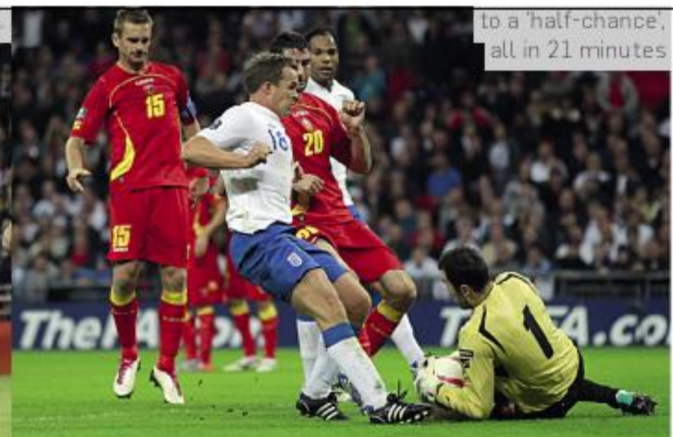
to a 'half-chance', all in 21 minutes