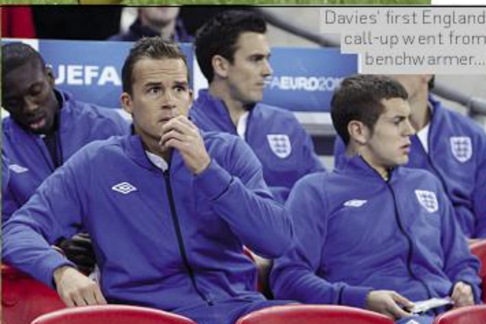
Davies' first England call-up went from benchwarmer...