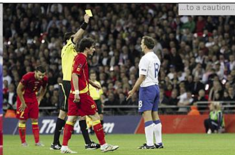
...to a caution...