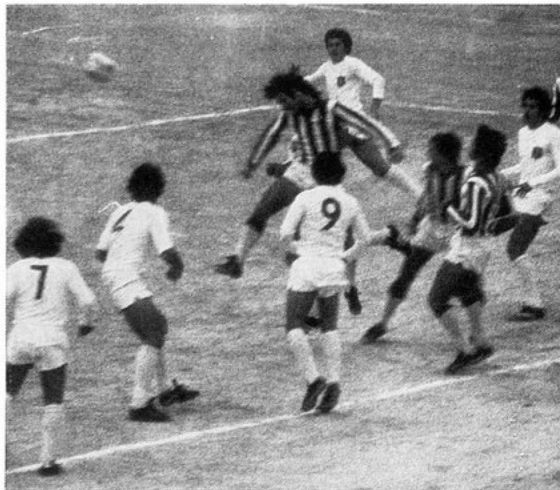
A Floriana defender heads clear during a city attack.