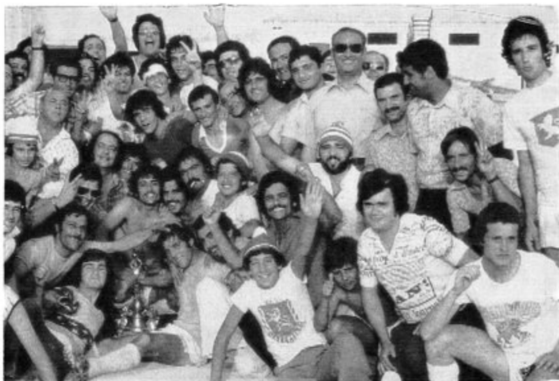
Valletta supporters and players with the F.A. Trophy.