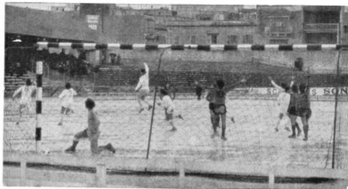
Valletta players cheer up in scoring against Hamrun Spartans. Valletta 2, Hamrun Spartans 1