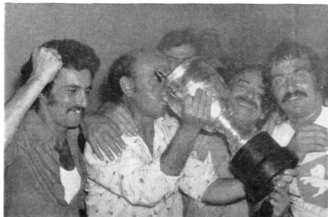
Il-coach tal-Valletta jiccelebra wara r-rebha.