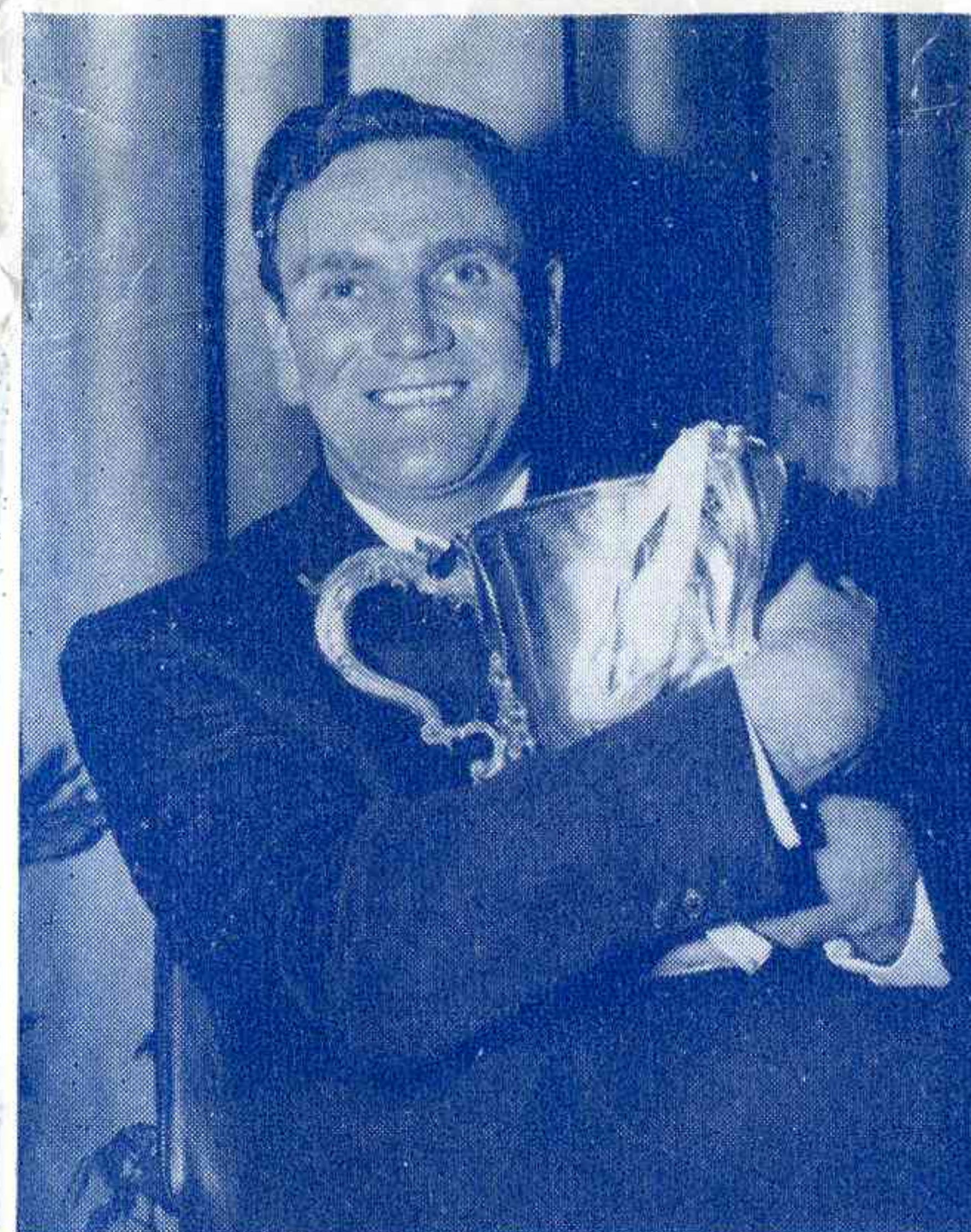
First of the four we hope to collect